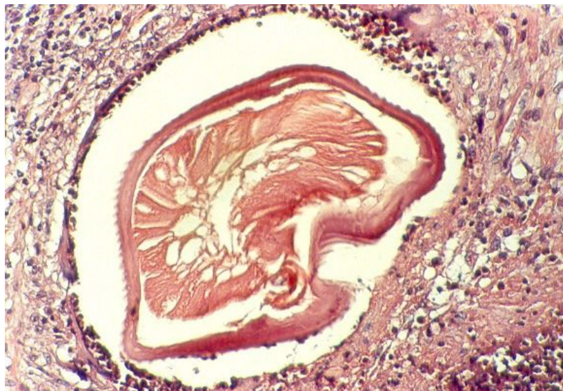
Fig. 2: Section of D. repens with external longitudinal cuticular ridges and a well-developed muscle layer