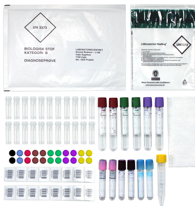
Figure 1 Complete sampling kit for The Danish Center for Strategic Research in Type II Diabetes.

A detailed description of sampling and handling was initially written and made available on the DD2 website. Later this was accompanied by video instructions for preparing the buffy coat. Following sampling and handling, the collected biological material is packed in certified packaging, contained in the kits, and mailed overnight to the biobank (see Figure 1). Most biochemical markers are stable for up to 30 hours. 9–11 At the biobank, samples are received and immediately stored at -80^{\circ}\text{C} in freestanding freezers. Currently, the laboratory centre at Vejle Hospital has employed a specialist in bioinformatics who is responsible for the biobank database administration and a biotechnologist who is responsible for all logistics. Similar activities have been established at the Danish National Biobank, including the establishment of a Danish National Biobank Registry ( http://www.nationalbiobank.dk ).