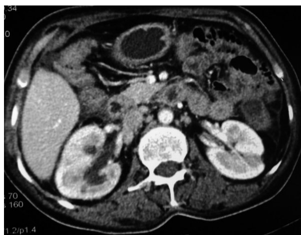
Figure 1. CECT abdomen showing thickened gut wall

Diagnosis of acute intestinal obstruction was made. Exploratory laparotomy was done. The whole of small bowel was adhered together like a cocoon ( Figure 2 and 3 ) from the duodeno-jejunal flexure to the ileo-caecal region, encapsulated within a peritoneal membrane with adhesions which were broken and the thick membrane was resected. Mesenteric Lymphadenopathy was noted. Histology of the membrane revealed caseating granuloma and giant cells with mild fibrosis and nodal microscopy revealed same features. A diagnosis of abdominal cocoon secondary to abdominal tuberculosis was suspected. Postoperatively, the patient was initiated