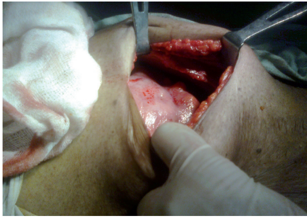
Figure 2. Abdominal cocoon seen on laparotomy

on anti-tuberculous treatment for 9 months. For initial phase of 2 months, Isoniazid (H) [600mg], Rifampin (R) [600mg], Pyrazinamide (Z) [2000mg], and Ethambutol (E) [1600mg] were used thrice a week and in continuation phase of 7 months only Isoniazid (H) [600mg] and Rifampin (R) [600mg] were used thrice a week. During 3 year of postoperative follow-up period, the patient remained asymptomatic.