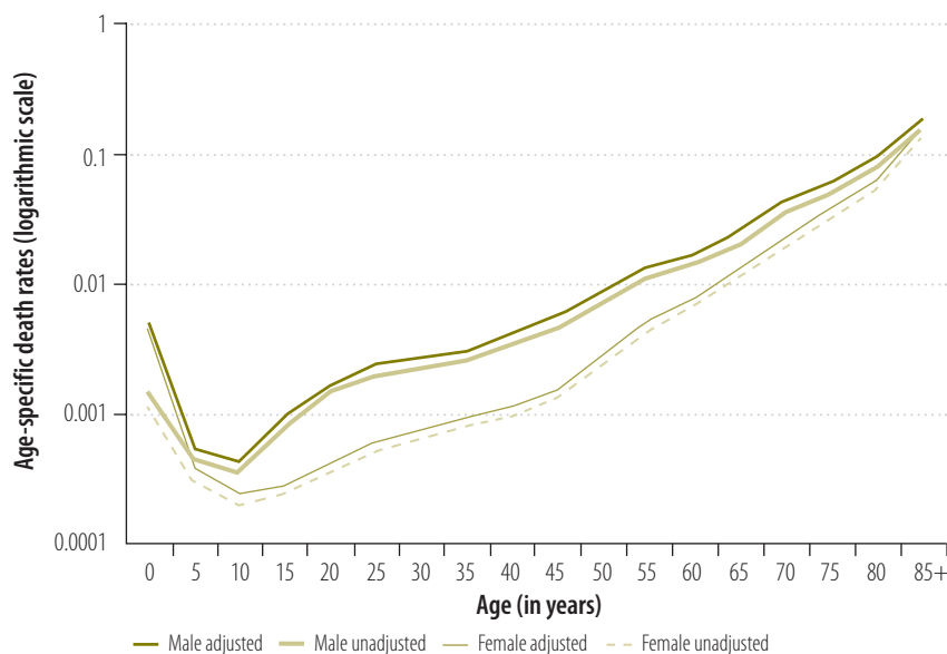
Fig. 3. Logarithmic plots of age- and sex-specific mortality rates (unadjusted and adjusted), Viet Nam, 2009

fectious diseases. Furthermore, although liver cancer is a leading cause of death in both males and females, chronic hepatitis B among adults probably accounts for a large proportion of liver cancers in Viet Nam. 24 Although these mortality indicators suggest that Viet Nam is experiencing an epidemiological transition, the country's current mixed burden of communicable and non-communicable