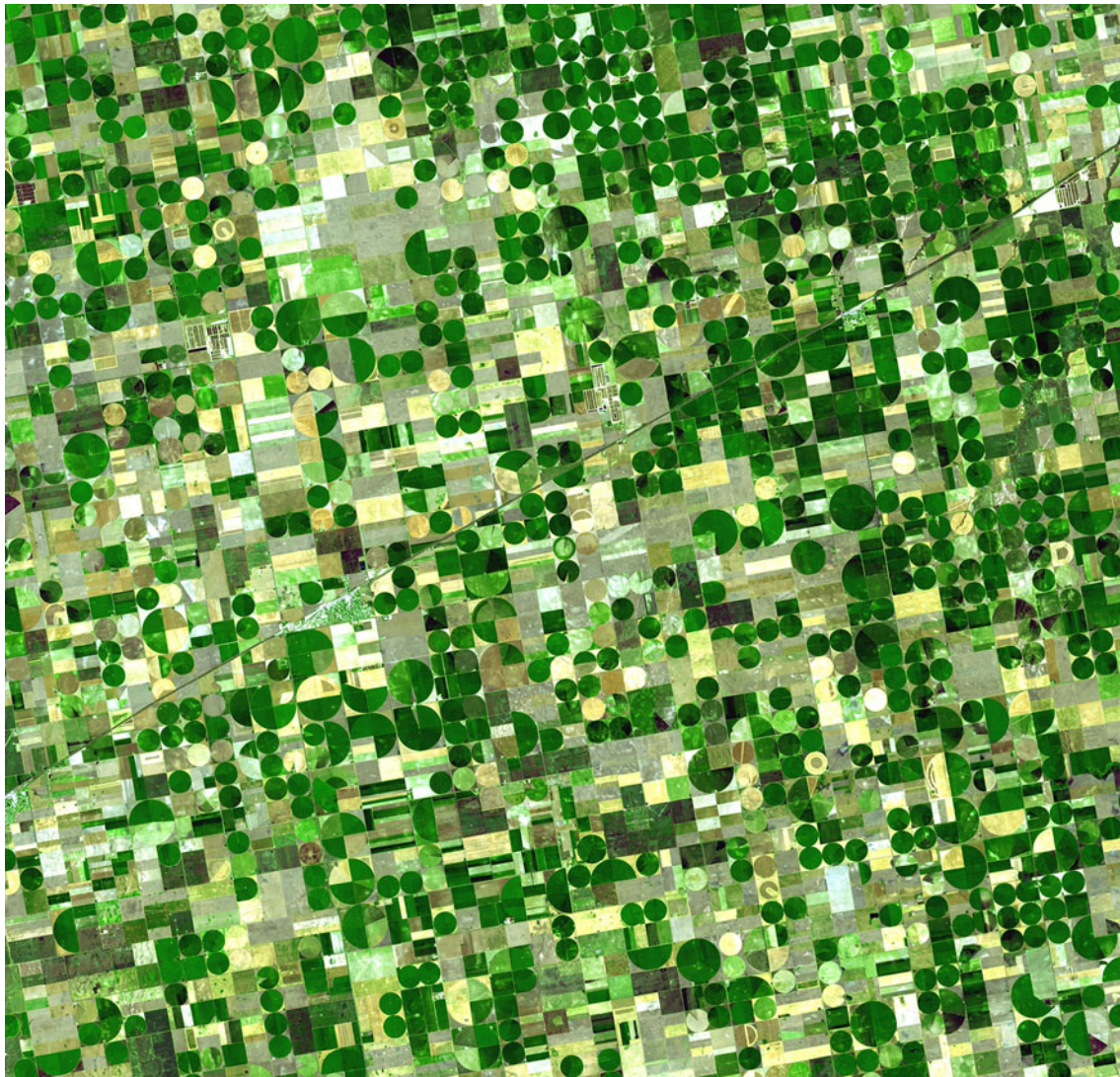
Fig. 1 Variegated green crop circles cover what was once shortgrass prairie in southwestern Kansas.

extensive irrigation using ground water, and, by 2007, water table declines ranged from 3 m to over 45 m. For Kansas, depending on the location, the aquifer will run dry in 25 to 200 years (Buchanan et al. 2009). The saturated thickness decline by over 50 % in some parts of the aquifer has in turn led to declines in the flows in many streams in the High Plains with attendant deterioration in riparian and aquatic ecosystems (Sophocleous 2010).