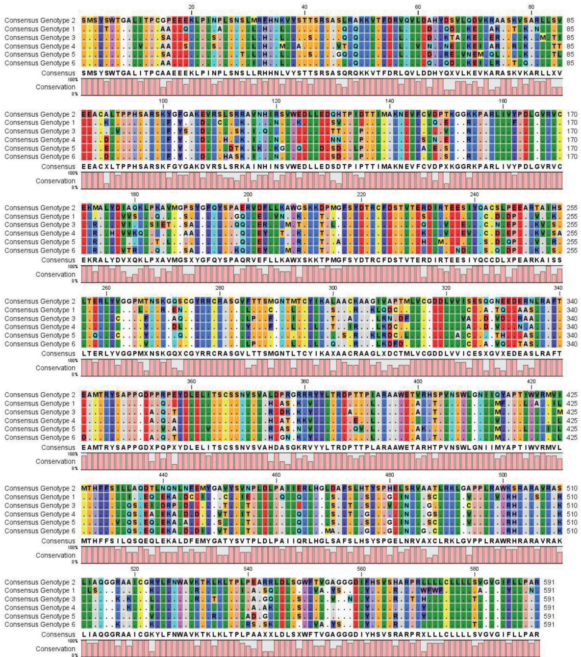
Figure 1. Multiple Sequence Alignment of Consensus Sequences of the Genotypes 1 to 6 of the HCV NS5B Protein Are Shown

acid long beta hairpin loop is present in the HCV NS5B protein which protrudes from the enzyme active site. This loop interferes with binding to the double stranded RNA due to steric hindrance (11, 12). The consensus sequence analysis shows that this loop is highly variable among all the HCV genotypes. It is reported that E18, Y191, C274, Y276 and H502 are important for interaction of template/primer (11). Consensus sequence analysis shows that these residues are highly conserved among