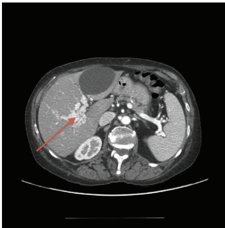
FIGURE 2: Residual portal cavernoma showed at CT scan.

and nutritional status, while US Doppler showed a residual portal cavernoma, confirmed at CT scan (Figure 2).