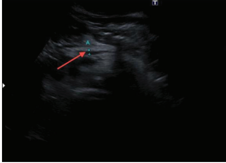
FIGURE 1: Abdominal US showing a portal vein thrombosis extended to intrahepatic branches.