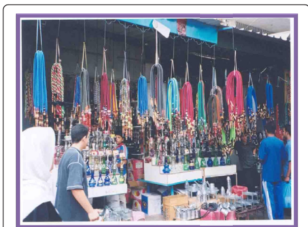
Figure 1 Water-Pipe store in an Arab village in northern Israel.