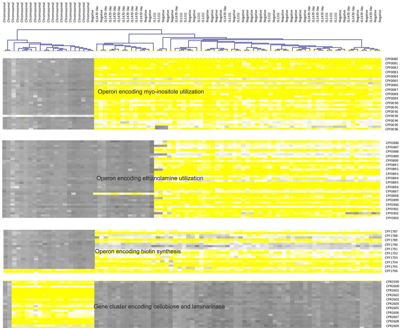
Figure 2. Genes differentiating the chromosomal cpe -carrying C. perfringens strains from the plasmid-borne cpe -carrying and cpe -negative strains. The figure was constructed using the MEV software [28]. doi:10.1371/journal.pone.0046162.g002

which are important for soil and intestinal bacteria competing in complex environments. The majority of the chromosomal cpe -carrying strains in this study also lacked the fucose and sialidase encoding genes, which further diminishes the territory of the chromosomal cpe -positive strains [31]. Presumably, the chromosomal cpe -positive strains are not ubiquitous and soil or intestines are not the habitat of these strains, although the chromosomal strains may compensate for some of the aforementioned deficiencies by producing toxins or by acquiring appropriate genes from the environment. This is supported by the presence of many IS-elements suggestive of gene transfer [31].