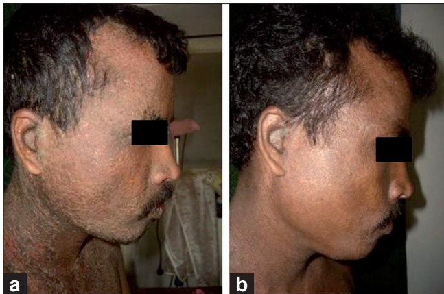
Figure 1: (a) Scaly papules on the face before treatment, (b) After treatment

The patient was started on low-dose isotretinoin (20 mg/day) along with a tapering dose of oral corticosteroids and topical bland emollients. There was dramatic response within 2 weeks, with >50% improvement in the condition of our patient [Figure 1b, 2b]. We had started the patient's elder brother [Figure 4] on high-dose isotretinoin (40 mg/day) at the time of presentation and once his lesions were under control this was reduced to low-dose isotretinoin.