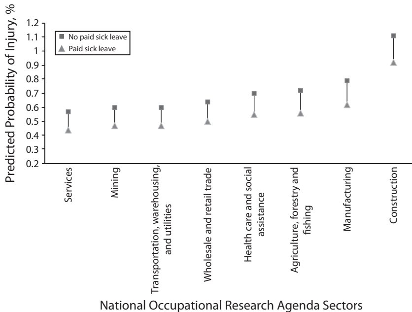
FIGURE 1—Predicted probabilities of nonfatal occupational injuries, by availability of paid sick leave and occupational sector: National Health Interview Survey, 2005–2008.

a supplement to the online version of this article at http://www.ajph.org ), and the difference was statistically significant (2-sample test of proportion: z = 8.36 , P < .001 ). Higher educational levels were associated with a higher level of access to paid sick leave. More workers in the northeastern part of the country (64%) than workers in other regions (56% on average) had access to paid sick leave. With respect to differences in access to paid sick leave for events or exposures contributing to occupational injuries (Figure C, available as a supplement to the online version of this article at http://www.ajph.org ), workers without paid sick leave were more likely than workers with paid sick leave to have injuries caused by machines ( z = 1.68 , P = .05 ) and to be struck by objects ( z = 1.28 , P = .09 ).