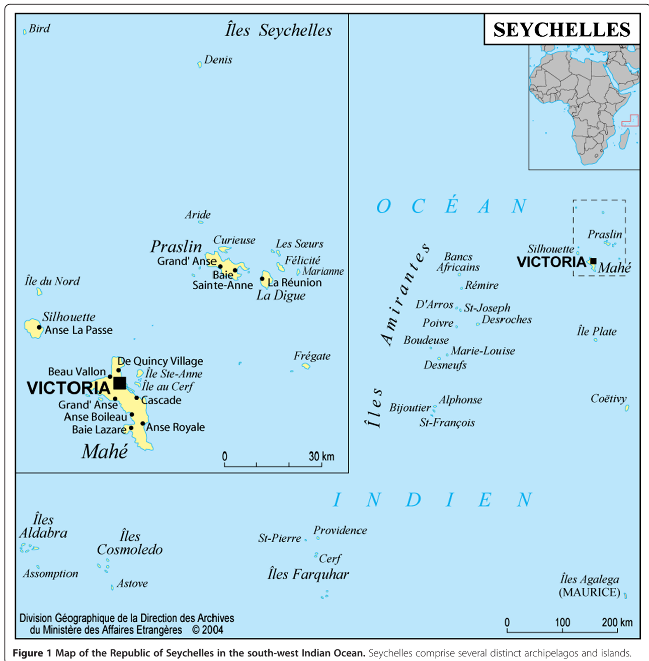
Figure 1 Map of the Republic of Seychelles in the south-west Indian Ocean. Seychelles comprise several distinct archipelagos and islands.

reaching 20% in Port Glaud, on Mahé, and 17% in Praslin. In the vector, nine natural infections were found in 429 Culex quinquefasciatus (= 2.1%) collected at Port Glaud, with one mature Wuchereria bancrofti larvae [13]. Natural infections and experimental transmission showed that Cx. quinquefasciatus is the main and probably only vector in the Seychelles.