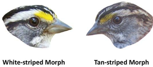
Figure 1. Plumage polymorphism in the white-throated sparrow. In both sexes, the white-striped morph (WS; left) has alternating black and white crown stripes, brighter yellow lores, and a clearer white throat patch. The tan-striped morph (TS; right) has alternating brown and tan crown stripes, duller lores, and dark bars within a duller throat patch. doi:10.1371/journal.pone.0048705.g001