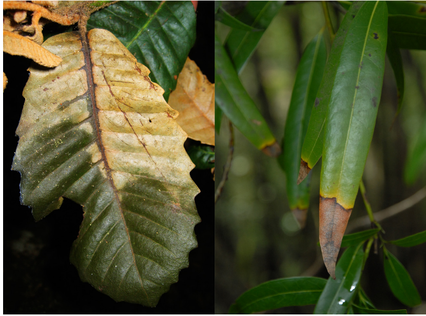
FIG 2 Foliar lesions caused by Phytophthora ramorum colonizing a tanoak leaf through the petiole and following the midvein (left), and causing lesions on a bay laurel where a film of water accumulates for several hours after rain events (right).