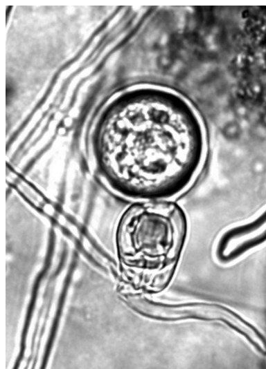
FIG 1 A viable, thick-walled oospore of Phytophthora ramorum produced by crossing an NA1 with an EU1 genotype.

P. ramorum is in the so-called clade 8 of the genus Phytophthora and is a close relative of P. lateralis , P. hibernalis , and P. foliorum (73). The origin of P. ramorum is still unknown, but the recent discovery in Taiwan of P. lateralis (7), a species also presumed to be exotic and present in California and Oregon, suggests that this group of phytophthoras may have an eastern Asian origin. P.