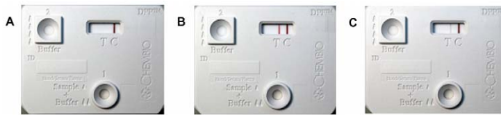
Figure 2. Representative non-reactive, strongly reactive, and weakly reactive DPP assay results. Demonstration of (A) non-reactive, (B) strongly reactive, and (C) weakly reactive visual interpretations for the DPP assay. Coloration of the test line (“T” on rapid test cartridge) indicates the presence of anti-rLig antibodies in the biological sample while coloration of the control line (“C” on rapid test cartridge) indicates the presence of non-specific antibodies and denotes a valid test result. DPP = Dual Path Platform. doi:10.1371/journal.pntd.0001878.g002

stratifying severe disease case-patients by end organ injury, manifested as jaundice and elevated serum creatinine, correlated with DPP positivity. Even though the model was biased toward the sickest patients, these findings suggest a potential means for stratifying PPV on clinical criteria.