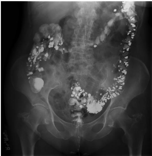
Fig. 2. Remaining barium in the diverticula at 48 h post procedure. After 48 h of liberal oral fluids and ambulation to minimize any risk of colonic impaction, the patient was able to tolerate clear liquids without any nausea, vomiting, or abdominal pain. This abdominal X-ray done 48 h after treatment showed barium remaining in the diverticula throughout the colon but largely cleared from the lumen proper.