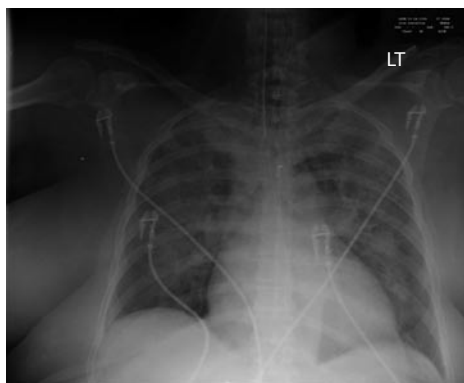
Figure 1 Chest X-ray showing bilateral lung infiltrates.