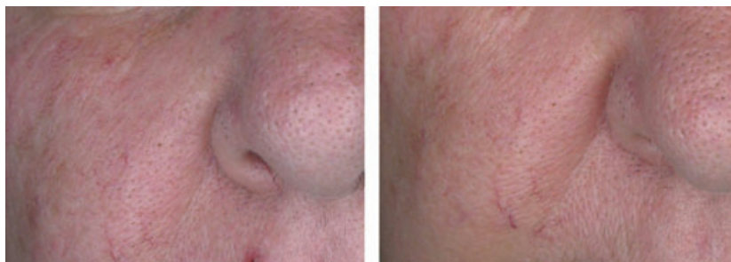
Figure 4 Right cheek erythema improvement after 28 days of treatment with P-3075.

No local adverse reaction was reported in both treatment groups. Compliance was excellent in all patients.