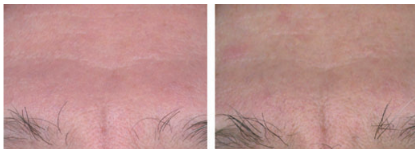
Figure 3 Front erythema improvement after 28 days of treatment with P-3075.

Moreover, a statistically significant decrease was detected at D7 for burning ( P = 0.004 in the chi-square test and P = 0.009 in the Fisher exact test), at D14 for stinging ( P = 0.014 in the chi-square test and P = 0.008 in the Fisher exact test), and flushing ( P = 0.011 in both the chi-square test and the Fisher exact test).