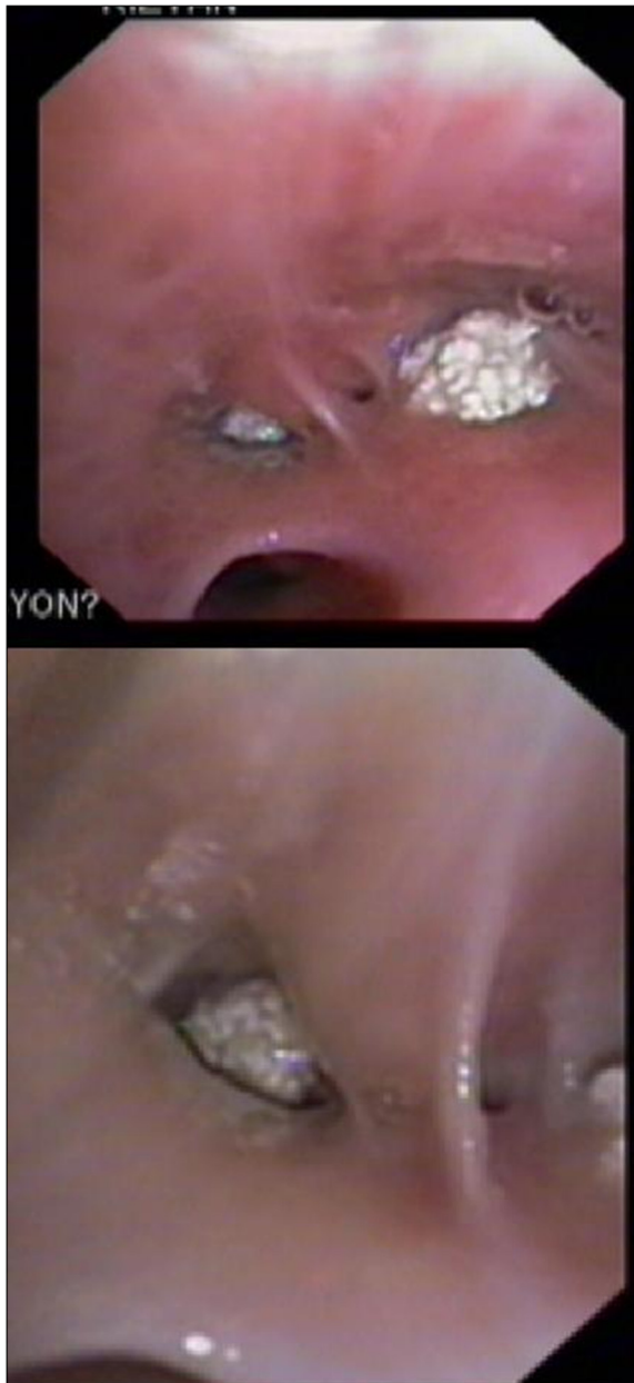
Figure 4 Videobronchoscopy image showing the tumorous subtype of endobronchial tuberculosis.

caseous necrosis with formation of tuberculous granuloma can be found at the mucosal surface [13]. 4) When the inflammation erupts through the mucosa, an ulcer is seen. 5) The ulcer of bronchial mucosa evolves into hyperplastic inflammatory polyps. 6) The endobronchial tuberculous lesion heals by fibrostenosis [7]. Chung's classification was based on this six-step pathological course of tuberculosis, respectively represented by the 1) nonspecific bronchitic, 2) granular and edematous-hyperemic, 3) actively caseating, 4) ulcerative, 5) tumorous, and 6) fibrostenotic types [4].