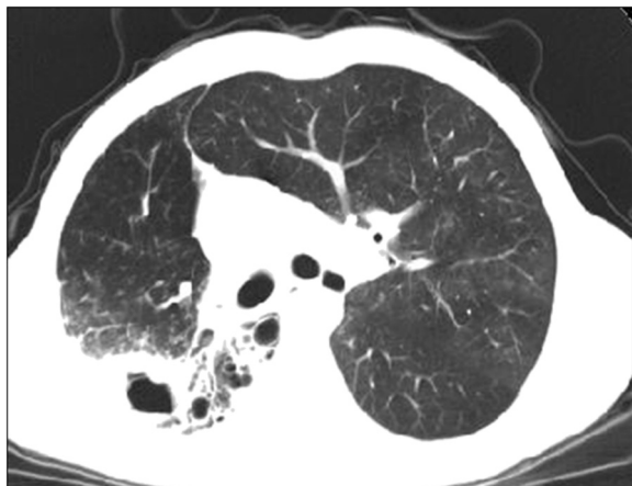
Figure 2 CT showing cavitation and infiltration.

The present study classifies EBTB cases according to Chung's classification and investigates whether there are any differences in microbiologic results among these subtypes for AFB staining and tuberculosis culture. The edematous-hyperemic subtype was the commonest appearance, seen nearly in one-third of patients. While the highest smear and culture positivities for Mycobacterium tuberculosis in BL fluid were seen in the granular type, both tests were negative in patients with fibrostenotic and nonspecific bronchitic EBTB.