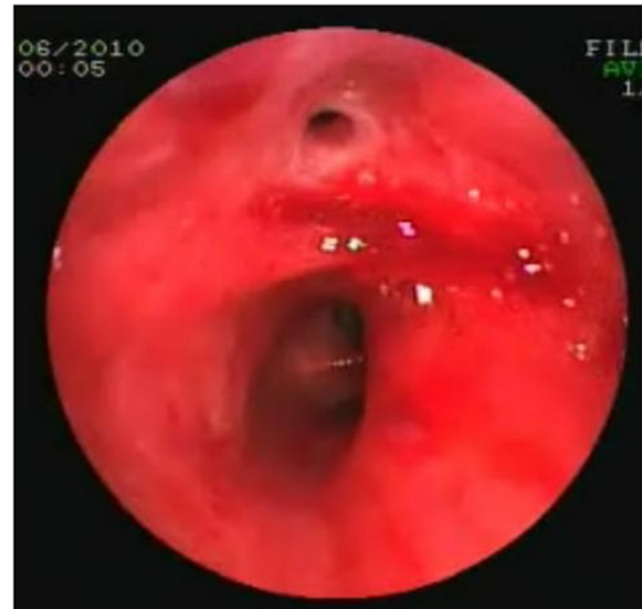
Figure 6 Videobronchoscopy image showing the edematous subtype of endobronchial tuberculosis.

The yield of sputum smear for AFB is not as high as it is in parenchymal involvement, even in an optimal laboratory set up for meticulous sputum examination. In recent studies, sputum positivity in EBTB has been demonstrated to range from 16% to 53.3% [5,14,15]. In our study, sputum smears for AFB were negative in all patients. The low yield of sputum AFB smears may be