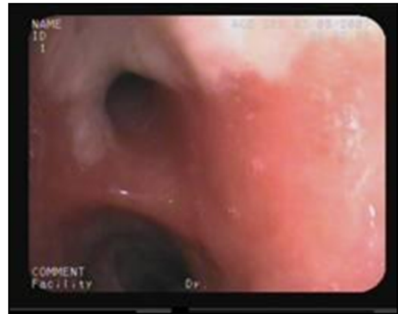
Figure 5 Videobronchoscopy image showing the actively caseating subtype of endobronchial tuberculosis.

caseous necrosis with formation of tuberculous granuloma can be found at the mucosal surface [13]. 4) When the inflammation erupts through the mucosa, an ulcer is seen. 5) The ulcer of bronchial mucosa evolves into hyperplastic inflammatory polyps. 6) The endobronchial tuberculous lesion heals by fibrostenosis [7]. Chung's classification was based on this six-step pathological course of tuberculosis, respectively represented by the 1) nonspecific bronchitic, 2) granular and edematous-hyperemic, 3) actively caseating, 4) ulcerative, 5) tumorous, and 6) fibrostenotic types [4].