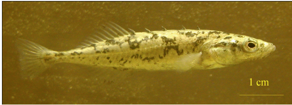
Figure 1. Brook stickleback ( Culaea inconstans ).

Bell 2007). However, no studies have yet focused on the relationship between aggressive behaviors toward conspecific and heterospecific competitors among populations that vary in the presence of the competitor. Our objective was to estimate this relationship in brook stickleback ( Culaea inconstans ; Fig 1), and by using variation among populations, to evaluate how behavior may have evolved. Populations of brook stickleback are found both allopatric from and sympatric with ninespine stickleback ( Pungitius pungitius ). Both species share a similar ecological niche in the shallow inshore waters (Wootton 1976; Gray et al. 2005) where interspecific competition for defendable benthic resources affects growth and morphology (Gray and Robinson 2002; Gray et al. 2005). Adult wild-caught sympatric brook stickleback were more aggressive toward ninespine stickleback than allopatric brook stickleback, suggesting that HA is beneficial in the presence of a competitor (Peiman and Robinson 2007). Variation in HA was also heritable, as juvenile brook stickleback from sympatric populations were more aggressive toward ninespine stickleback than allopatric brook stickleback when reared in a common laboratory environment (Peiman and Robinson 2007).