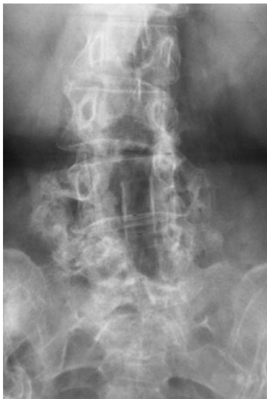
Fig. 1 Twenty-four month follow-up antero-posterior radiograph of OP-1/autograft patient showing solid bridging bone between the transverse processes

Autograft bone was harvested from the posterior iliac crest. Amount of autograft taken was based on an intraoperative surgeon decision based on the amount of graft material needed to span the space between the transverse processes. This graft was then mixed with one unit of OP-1 putty per side.