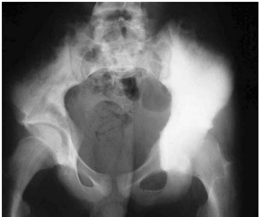
Fig. 4 Tight hamstrings syndrome, Ewing's sarcoma of the left iliac bone, X-ray of the pelvis anterior to posterior

“Lendenstrecksteife” as well as “fixed lumbar lordosis” is applied in the German literature [6, 9, 12]. “Tight hamstring syndrome” associated with spondylolisthesis was used by Phalen and Dickson in 1960 [13]. Martens et al. [10] used the same term and described various underlying pathologies. However, the described clinical