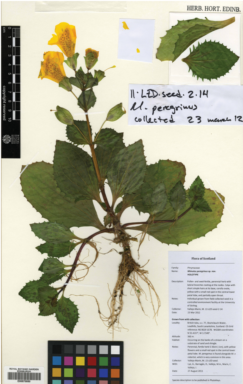
Figure 1. Holotype of M. peregrinus Vallejo-Marin [11-LED-seed-2-14; barcode E00570050].