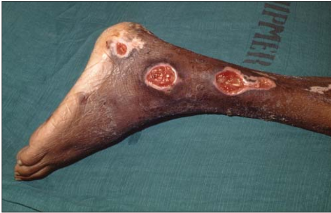
Figure 5: Pressure ulcer over the lateral border of heel, lateral malleolus and lateral border of fibula due to pressure in lateral posture