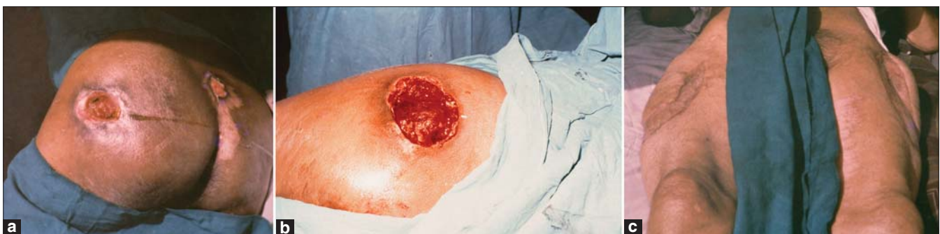
Figure 3: (a) Left trochanteric pressure ulcer with a small external wound (b) The ulcer after debridement of the ulcer edge and the underlying bursa. One can notice the large wound under a small and deceptive pressure ulcer (c) Bilateral Trochanteric pressure ulcers have been resurfaced with bilateral tensor fascia lata myocutaneous flaps