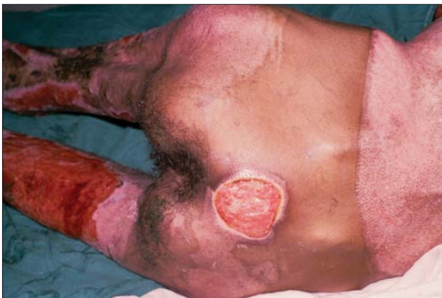
Figure 7: Sacral pressure ulcer in a patient with 60% total body surface burn

pressure over the blood vessels, decreases the pressure difference between the capillary blood and the tissue fluid and hence, decreases blood flow and oxygenation to the tissues. Hence, edema does not prevent rather enhances the deleterious effect of pressure.