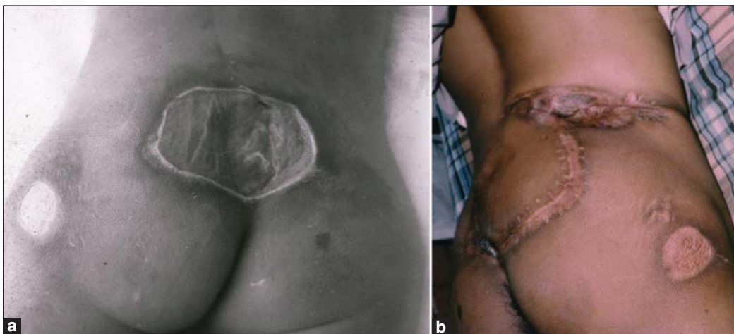
Figure 2: (a) A large sacral ulcer (b) Sacral ulcer has been managed with transverse back flap