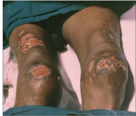
Figure 6: Pressure ulcer over the knee and thigh because of the pressure in prone position

The extrinsic and intrinsic factors discussed above are the causative factors. There are a large number of other factors which are called risk factors. These factors should be looked for during the pre-ulcer period for a proper assessment of the risk of development of a pressure ulcer in a given patient. This is usually done by the nursing