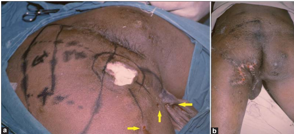
Figure 1: (a) Left sided ischial pressure ulcer with multiple sinuses in a paraplegic patient. Sinuses are highlighted with arrows. Gluteus maximus muscle has been marked for raising as a muscle flap (b) Complete excision of the ulcer with excision of sinuses has been done. The gluteus maximus muscle flap has been used to cover the ischial tuberosity and for filling the cavity