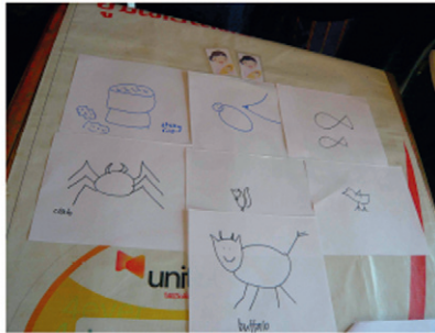
Village 4 - breast milk, rice, fish, crab, squirrel, buffalo, bird