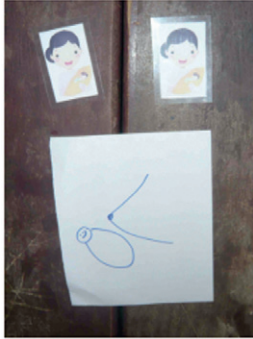
Village 1 - breast milk