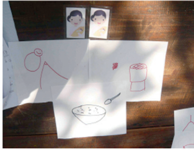
Village 3 - breast milk, rice, porridge