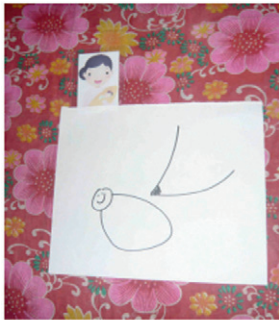
Village 2 - breast milk