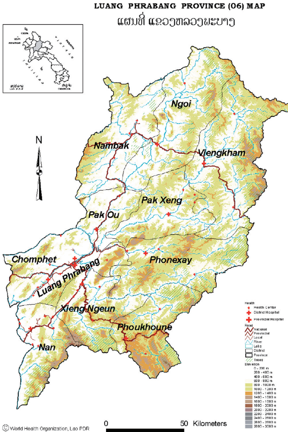
Fig. 1. Map of Luang Prabang province.