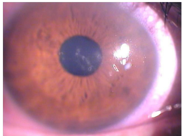
Figure 1 Biomicroscopic image of the right eye of a 27-year-old male patient one day after corneal collagen cross-linking with riboflavin and ultraviolet A irradiation. Note: The epithelium shows some superficial irregularity, but the overall cornea appears very clear.

Sixteen eyes from 16 patients (eight men, eight women) with keratoconus were included in the study. The mean age of the patients was 34.4 ± 11.9 (range 18–61) years. All patients attended the 6-month follow-up. One-year follow-up results were available for seven patients. All procedures were uneventful and no intraoperative complications were observed. No damage to the limbal region of any patient was observed. The epithelium was completely healed within one day after treatment (Figure 1) in all patients. Intraocular pressures evaluated by Goldmann applanation tonometry were less than 18 mmHg in all eyes. Fundus examinations were within normal limits. In the treated eyes, the corneal thicknesses and the endothelial cell densities and morphologies