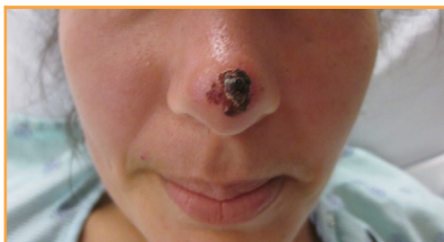
FIGURE 2. Nasal tip with necrotic, hemorrhagic crust due to reexposure to levamisole-laced cocaine.

Laboratory findings include leukopenia, neutropenia, agranulocytosis, positive antinuclear antibody titers, positive anti-proteinase 3 titers, and positive perinuclear or cytoplasmic staining patterns for antineutrophil cytoplasmic antibodies. Absolute neutrophil counts ranging from 0 to 3000 have been reported, and these patients are at high risk of infection. 32 Bone marrow biopsies from such patients have shown markedly decreased production of all cell lines. When positive, antinuclear antibody is often mildly or moderately elevated, most commonly in a speckled pattern. Anti-double-stranded DNA and lupus anticoagulant findings are also inconsistently positive in various case reports and series. 23,24,32-36 Complement studies typically yield normal results, although mildly decreased levels of C4 and/or C3 have been reported. Urine toxicology studies are usually positive for cocaine and occasionally for levamisole. 24,37,38 Levamisole may also be found on drug paraphernalia such as pipes, paper currency, or other tools used for smoking or snorting cocaine.