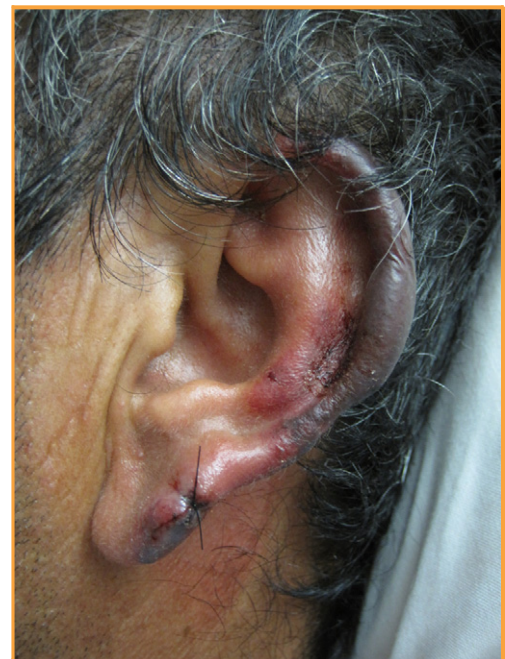
FIGURE 1. Left helix with hemorrhagic bullae. Suture on upper ear lobe is biopsy site.

The pathologic mechanism of these symptoms is unclear, as some patients present with true vasculitis while others present with pseudovasculitis. Among the cases presenting as a true vasculitis, direct immunofluorescence findings suggest an immune complex-mediated vasculitis with vascular deposits of IgM, IgA, IgG, and C3, and vascular staining for fibrin. 23,24,29,30 In addition to characteristic cutaneous manifestations, the majority of patients complain of arthralgias, most commonly involving the large joints. Ear, nose, and throat complaints are also common, as are feelings of generalized malaise and fatigue. 31