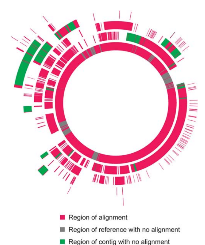
Figure 1 Alignment of ANAS metagenome Dhc contigs (identified by TF and/or SS) to the Dhc strain 195 genome. The inner circle represents the reference strain 195 genome, with the origin of replication at the top. Magenta areas indicate alignment to ANAS metagenome contigs, whereas gray areas indicate regions with no alignment. Each contiguous bar in the outer circles represents a contig, positioned based on its aligning regions, with contigs plotted on different circles to avoid overlap. Green areas indicate regions with no alignment to the reference genome, potentially containing novel Dhc genes (if they also do not align to other Dhc reference genomes).

The corrin ring synthesis genes are on contig ANASEMC C6240, which was identified as Dhc by