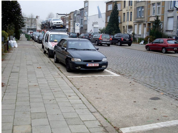
Figure 4 A sidewalk often used by careless cyclists.

from crime and therefore their walking experience. After dark participants disliked and avoided walking in abandoned streets, they liked the presence of other persons. A 75-year-old man talked about walking around in the city center during the evening: