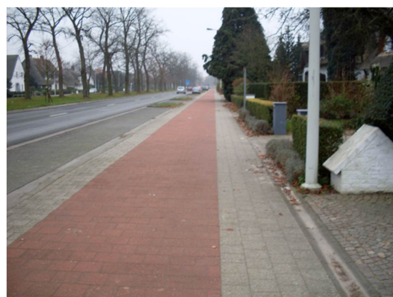
Figure 3 Red tiles clearly marking the cycling path.

Behavior of other road users Some participants expressed safety concerns related to the behaviors of other road users. Participants liked streets with slow traffic and disliked streets with speeding cars. This topic was mostly discussed near street crossings, especially when approaching cars were not visible (e.g. near sharp turns). Participants proposed solutions like speed bumps and chicanes to slow down traffic. On the other hand, participants also mentioned car drivers being very courteous and giving priority to pedestrians at crossings.