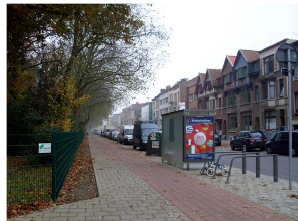
Figure 5 A street with a park on the one side and old, beautiful houses on the other side.

Next to the presence of vegetation, the presence of animals (e.g. birds, sheep, squirrels. . .) was considered pleasant as well.