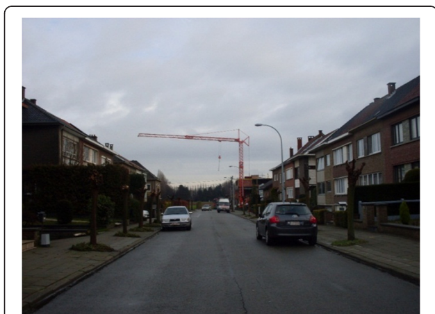
Figure 6 A street with an open view that is getting filled with buildings.

Our finding that good access to facilities (i.e. shops and services) encourages walking for transportation supports results from previous qualitative [20,22,23,25] and quantitative studies [35,40,41]. Findings from the current study suggest that convenience (short distances) might not be the only explanation why the presence of facilities promotes walking for transportation. The presence of other people in shops and shopping streets might as well evoke feelings of safety from crime and provide opportunities for social contacts. Furthermore, our participants enjoyed looking at the show windows of shops. When designing new neighborhoods or senior housing, planners should foresee facilities within walkable distances from the residences. Integrating shops and services into existing neighborhoods might be more difficult to establish. However, the disappearance of local shops and services should be avoided as this might negatively affect walking for transportation among older adults.