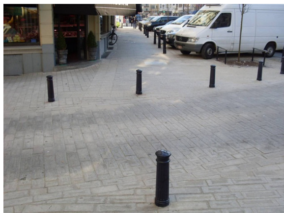
Figure 2 An even sidewalk with bollards separating it from traffic.

neighborhoods and cul-de-sacs, because they are safer and less noisy. In this respect, participants also complained about car drivers using shortcuts causing traffic to be busy in small and normally quiet streets.