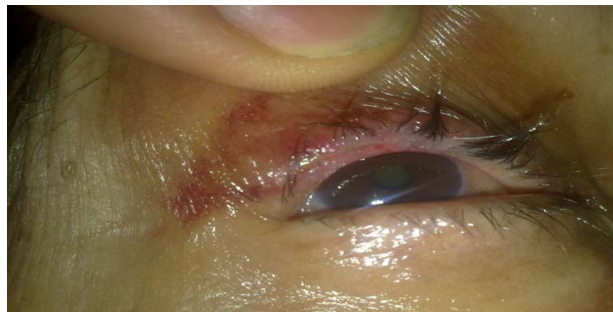
Figure 2 Postoperative photography of the case in Figure 1.

Postoperatively, we prescribed antibiotic eye ointment and lubricant for 1 week to all patients (Figure 2). All patients were followed every week for 1 month, then monthly