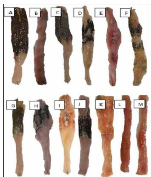
Fig. 1. Macroscopic presentation of TNBS-induced colitis in rats. A: Vehicle treated colitis (2.5 ml/kg), B: Normal colon (Sham), C, D, E: Colitis treated with oral quince juice (200, 400, 800 mg/kg) respectively, F: Colitis treated with quince juice intraperitoneally (400 mg/kg), G, H, I: Colitis treated with oral quince hydroalcoholic extract (200, 500, 800 mg/kg) respectively, J, K: Colitis treated with quince hydroalcoholic extract intraperitoneally (200, 500 mg/kg) respectively, L: Colitis treated with oral dexamethason (2 mg/kg), M: Colitis treated with dexamethason intraperitoneally (1 mg/kg).

Data analysis also showed that there was no significant differences ( P>0.05 ) between the data of different administration routes with the same doses.