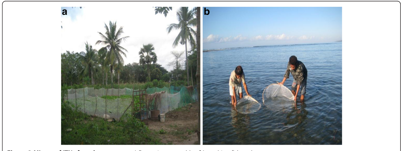
Figure 2 Misuse of ITNs for other purpose. a) Protecting vegetables; b) catching fish and prawns.

Globally, it is acknowledged that the Global Fund has improved the coverage and quality of services for HIV/ AIDS, TB and malaria control [20]. In Timor-Leste, there was a positive impact on malaria morbidity reduction although this was only around 10 % at the end of