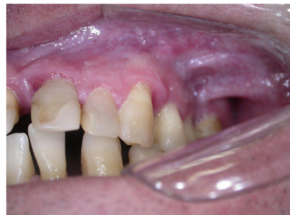
Figure 3 Clinical appearance of the site of the lesion 5 years from the surgery, exhibiting no recurrence.

CCOT are believed to be derived from odontogenic epithelial remnants within the gingiva or within the mandible or maxilla. The presence of ghost cells, the