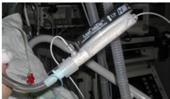
Figure 2 The anaesthetic-conserving device (AnaConDa®) in the clinical set-up.

as blood counts, hemostasis, parameters of infection, as well as indicators of hepatic and renal function are analyzed on a daily basis. In addition, serum levels of fluoride, cortisol, ACTH, and Troponin I are determined (Figure 1).