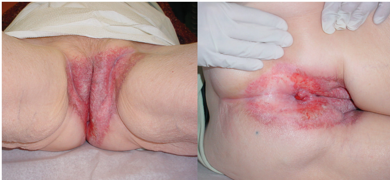
FIGURE 3 (A,B) Complete regression at 5 years post radiotherapy, with notable telangiectasia and fibrosis.

the condition, and yet histologically, the two diseases are identical 1 . Of patients with EMPD, 24% have an associated underlying adnexal adenocarcinoma, which has been associated with a worse prognosis, with mortality rates up to 46% being reported 6 . Up to 12% of patients with EMPD have a concurrent internal malignancy that may be located nearby, and this incidence has been found to be greatest in patients with PPD 6,7 .