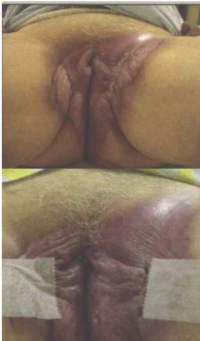
FIGURE 1 Extensive perianal Paget's disease in the perineum.

scrotum, perineum, and axilla—generally contain large concentrations of apocrine glands. Sir James Paget first described intraepithelial carcinoma of the breast in 1874 and suggested that the disease might also be found in other areas 2 . The first case of EMPD was described by Crocker in 1888, and perianal EMPD—also called perianal Paget disease (PPD)—was first reported in 1893 by Darier and Coulillaud 3 . The most thorough literature search (conducted by Brown et al. in 2002) found 141 papers reporting a total of 279 cases of PPD in some form 4 .