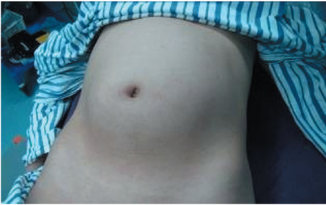
Figure 1. The patient showed abdominal swelling. A huge convex deformation bulged around the umbilicus.