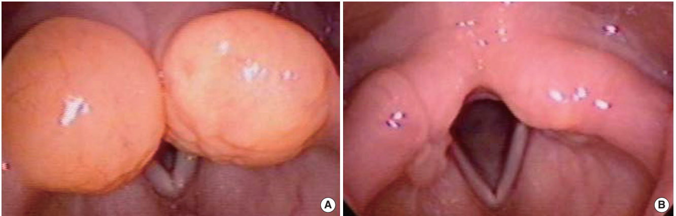
Fig. 1. (A) Fiberoptic laryngoscopy revealed two yellowish masses located on the apices of both arytenoid cartilages. (B) Two month follow-up fiberoptic laryngoscopy revealed a nearly clean state.

proteinaceous material with a well-defined \beta -pleated sheet ultrastructure, which is mainly derived from the mesoderm [2]. Amyloidosis occurs twice as frequently in the larynx as in any other part of the head and neck, and is either tumor like or takes the form of diffuse infiltrates [3]. However, localized laryngeal amyloidosis is a rare, accounting for 0.2-1.2% of benign tumors of the larynx [4]. Lesions in the larynx are localized to the ventricle, false vocal cords, true vocal cords, aryepiglottic folds, and subglottis, in decreasing order of frequency [5]. In this case, am-