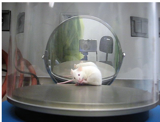
Figure 1. Hot-plate apparatus and endpoint behavior. Two observers were present during data collection, and a digital camera and mirror were set up to allow subsequent review of video recordings. This mouse is licking his hind paw, a nocifensive behavior.

Data collection. Each mouse was placed on the plate and watched by 2 observers (who remained blind to strain and treatment) until the mouse displayed one of the following