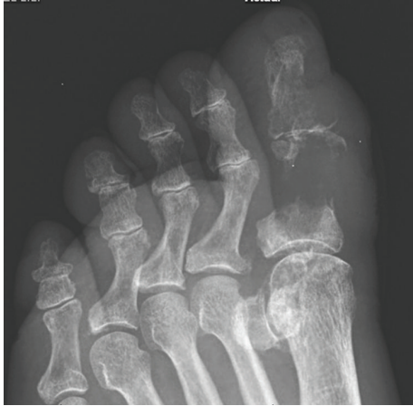
FIGURE 1: X-ray of right foot showing erosive and lytic lesion with cortical disruption in the proximal phalanx of the right hallux associated with soft tissue swelling.

of the hallux was done. The microbiology laboratory received the sample of drainage right hallux for bacteriological study, to which Gram stain was initially performed and fungal structures were observed like a large, round, fairly thick-walled cells with single and multiple buddings. Direct examination, with KOH 10%, observed unique spherical yeast budding and also observed crystal needle-shaped structures, which observed polarized light filters with characteristic of monosodium urate crystal. At 35°–37°C on liquid medium, was obtained multiple budding “pilot wheel” morphology of P. brasiliensis . Histopathological study and bone cultures for aerobic, anaerobic, and fungal growth were done. The pathology report was consistent with osteomyelitis. Histologic examination revealed multiple budding cells consistent with P. brasiliensis (Figure 2) and confirmed by isolation of the fungus in cultures and serological complementary diagnosis with agar gel immunodiffusion.