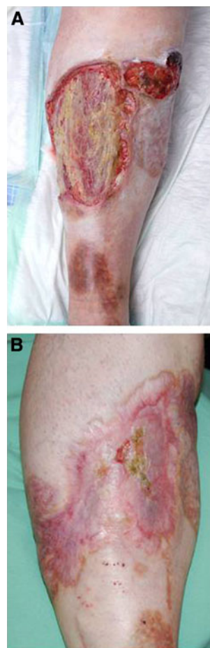
Fig. 1 Large pyoderma gangrenosum (PG) defect on the right lower leg after failure of several standard therapies and before treatment with adalimumab (a). PG almost healed after 64 weeks of treatment with adalimumab (b)

New therapeutic strategies take into account that patients with inflammatory bowel disease, which is frequently associated with PG, present increased levels of tumor necrosis factor- \alpha (TNF- \alpha ). Furthermore, PG itself seems to be associated with high serum levels of TNF- \alpha , resulting from an abnormal T-cell response in PG patients. Hence, several authors presumed that inhibition of TNF- \alpha could effectively treat PG [4–7]. In recent years, a growing rate of case reports about successful treatment of PG by the use of TNF- \alpha -inhibitors such as etanercept, infliximab, and adalimumab have been published.