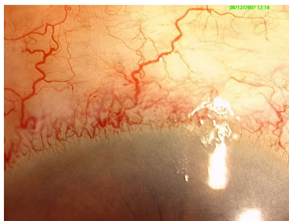
Figure 1. Preoperative photograph of the right eye of the patient with Sturge Weber syndrome showing conjunctival and episcleral vessels.

A standard limbus-based trabeculectomy with subconjunctival application of mitomycin C (0.2 mg/ml for 3 minutes) was performed to control his IOP. At 1 month follow-up, he presented with a well-functioning, diffuse bleb in his right eye. Three months postoperatively IOP in the right eye was 16 mm Hg. Slit-lamp examination revealed a diffuse avascular bleb. At 6 months, the bleb showed abnormal conjunctival vascularization in the form of palisades at the base of the bleb with a leash of anomalous vessels extending from the adjoining area over the anterior superior surface of the bleb. IOP in his right eye was 27 mm Hg. The trabeculectomy ostium was patent on gonioscopic examination. The patient was started on topical levobunolol 0.5% solution twice daily in the right eye for IOP control. At 1 year, the avascular area had decreased, while the conjunctival vascularization showed an increasing palisade of anomalous vessels