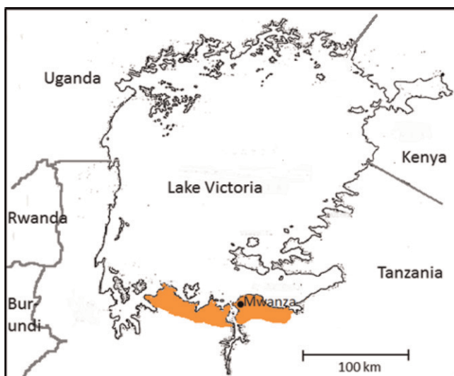
FIGURE 1. Lake Victoria, surrounding countries, and the Mwanza study area (shaded).

testing at the laboratory of the National Institute for Medical Research (NIMR) in Mwanza, Tanzania. Venous blood was also collected, and serum was separated and stored at -20^{\circ}\text{C} at the NIMR laboratory. Testing for syphilis and preparation of a portion of CAA test strips were performed at NIMR. Additional test strip preparation and all test strip reading were performed at the Leiden University Medical Center.