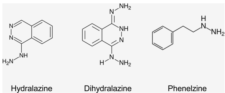
Figure 3. Chemical structures of the acrolein scavengers: hydralazine, dihydralazine, and phenelzine