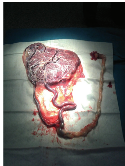
FIGURE 2: Photograph showing velamentous cord insertion of the placenta.

deceleration, loss of initial and/or secondary accelerations, persistence of secondary acceleration (overshoot), continuation of the FHR at a lower level, and biphasic deceleration.