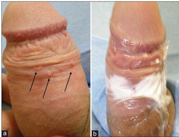
Figure 3: (arrows, a) Multiple penile warts at the dorsal surface of the preputial ridge. (b) Application of the occlusive dressing