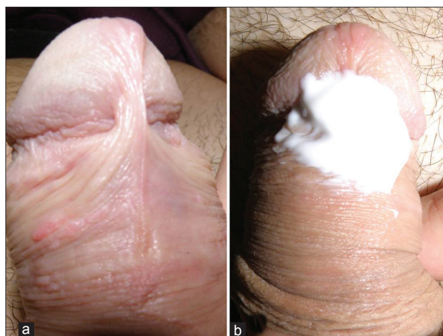
Figure 1: (a) A short frenulum case in a young patient. (b) Note limited amount of EMLA cream applied just before placement of the dressing

A total of 14 patients were subjected to meatotomy due to meatal stenosis. In five cases the patients presented Balanitis Xerotica Obliterans (BXO) affecting the glans and the meatus.