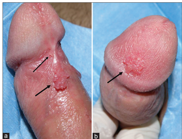
Figure 4: (a) Multiple HPV lesions (penile warts) at the frenular area and (b) the glans penis

procedure. In the rest of the 58 patients (79.5%) further local infiltration with 2% lignocaine was required in 24 cases