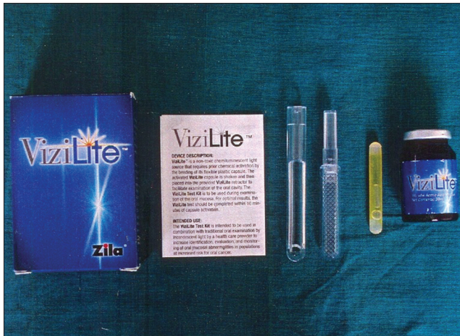
Figure 1: Chemiluminescent illumination kit