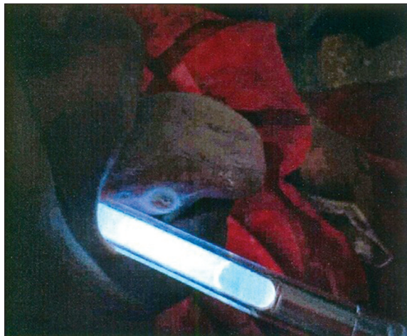
Figure 2: Chemiluminescent illumination positivity