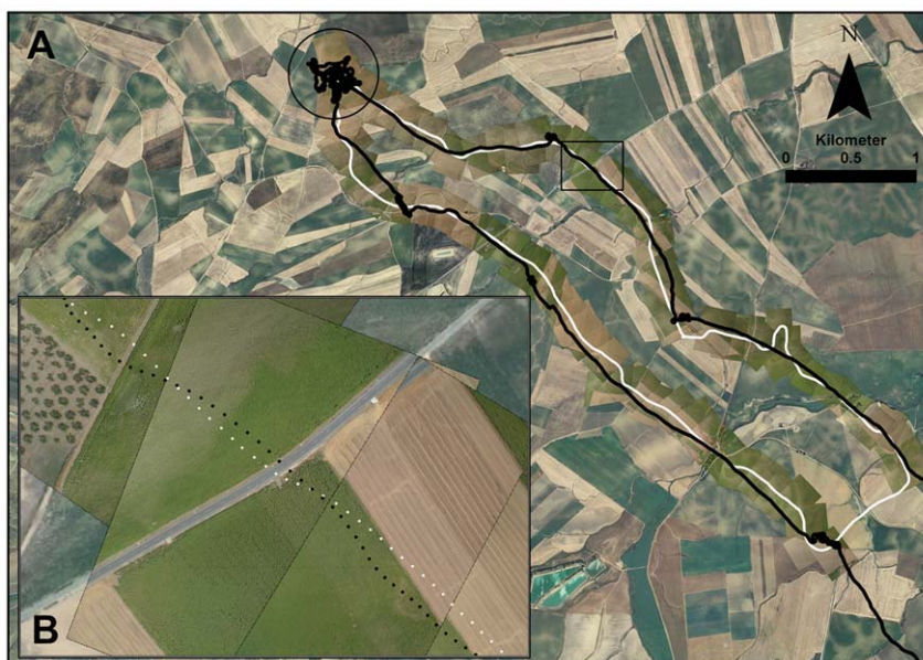
Figure 1. Track of a lesser kestrel foraging flight over the images obtained by an unmanned aerial system. A White and black tracks correspond to unmanned aerial system and lesser kestrel flights, respectively. The circle indicates the hunting area. The rectangle indicates the enlarged area in B. B High resolution images showing sunflowers, olive trees, road and harvested cereal fields. doi:10.1371/journal.pone.0050336.g001

The lesser kestrel is one of the smallest raptors in Eurasia and its size, and particularly body mass, poses a serious limit to the weight of biotelemetry devices or loggers that can be attached (about 5–6 g maximum, depending on the individual) to record spatial position or behavioral activity. During the course of our investigations on the lesser kestrel, that began in 1988 [29], we have always pursued to get an accurate knowledge of their daily movements at their breeding grounds. Applying radio transmitters and direct behavioral observations of unmarked individuals we have been able to determine foraging habitat preferences [30–32], but soon realized that we lost track of the birds more often than we located them, biasing our studies to locations near the breeding colony. Later on, geolocators have permitted us to determine that kestrels from southern Spain wintered in the Sahel area of western Africa [33]. While this was a breakthrough with conservation implications, due to the low spatial precision of the technology, it was useless to monitor movements at the breeding grounds. It was not until recently that programmable GPS data loggers small enough to be fitted in a lesser kestrel became available. This