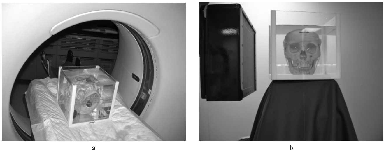
Figure 1 Skull immersed in water. (a) Placed in supine position in the multidetector CT. (b) Placed in upright position in the cone beam CT

For the CBCT intraobserver reliability (Figure 3), the first and second readings were significantly correlated ( p = 0.0005 ; \kappa = 0.30 with agreement of 76.36%). For the MDCT intraobserver reliability (Figure 3), the first and second readings were also significantly correlated ( p = 0.0001 ; \kappa = 0.39 with agreement of 81.82%). For CBCT interobserver reliability (Figure 3), the first CBCT reading by Observer A significantly correlated with the CBCT reading of Observer B ( p = 0.0181 ; \kappa = 0.20 with agreement of 70.91%) and the second CBCT reading by Observer A significantly correlated with the CBCT reading by Observer B ( p = 0.0127 ; \kappa = 0.21 with agreement of 76.63%). For MDCT interobserver reliability (Figure 3), the first MDCT readings by Observer A significantly correlated with the MDCT readings by Observer B ( p = 0.0155 ; \kappa = 0.20 with agreement of 70%), whereas the second MDCT reading of Observer A and the MDCT reading of Observer B were not significantly correlated ( p = 0.1403 ; \kappa = 0.10 with agreement of 66%).