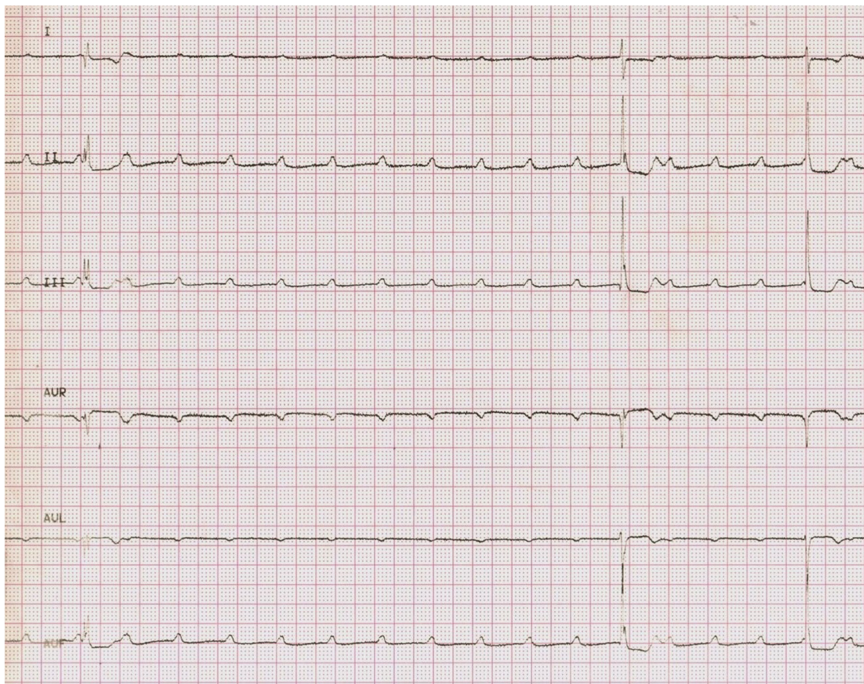
Figure 2 Electrocardiogram showing paroxysmal AV block and a 5.52 second period of asystolia.

series. Other types of rhythm abnormalities recognised during acute rheumatic fever include sinus node dysfunction, junctional rhythm and junctional tachycardia, ventricular tachycardia, torsade de pointes due to QT interval prolongation and complete left bundle branch block.