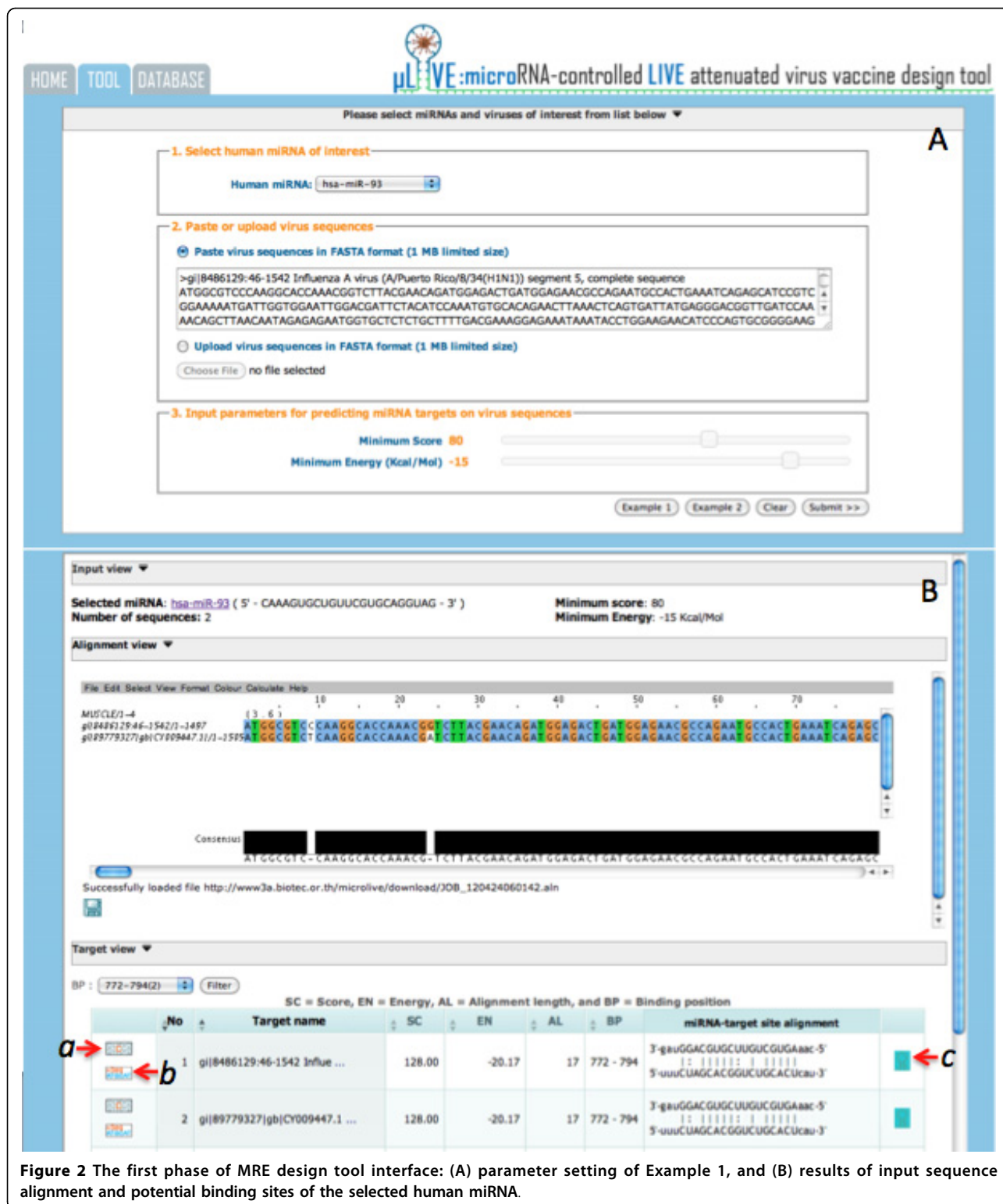
Figure 2 The first phase of MRE design tool interface: (A) parameter setting of Example 1, and (B) results of input sequence alignment and potential binding sites of the selected human miRNA.